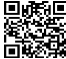
Scan for Guest Card

Welcome guest! We're so glad you've come to worship with us this morning. Please help us to get to know you better by filling out the green guest card on the back of the seat in front of you and dropping it in the collection basket. Or, for your convenience, you may scan the QR code and complete the guest card digitally. Thank you for taking the time to attend our service today. We hope to see you again soon!