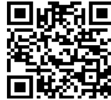
Scan for Guest Card

Welcome guest! We're so glad you've come to worship with us this morning. Please help us to get to know you better by filling out the green guest card on the back of the seat in front of you and dropping it in the collection basket. Or, for your convenience, you may scan the QR code and complete the guest card digitally. Thank you for taking the time to attend our service today. We hope to see you again soon!